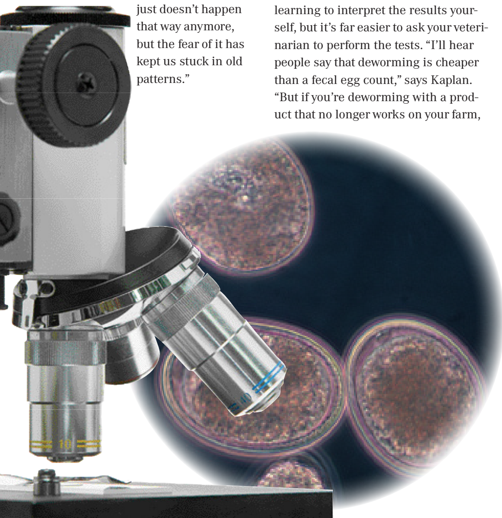
MICROSCOPE: ISTOCKPHOTO.COM ; PARASITE: VISUALSUNLIMITED.COM

These "high shedders" are impossible to identify without fecal egg counts, he says: "They don't look 'wormy' at all. In fact, they are often the fattest, happiest, healthiest-looking members of the herd. But they contaminate the environment heavily with parasite eggs, leading to an increasing infection pressure." Once a high shedder is identified using a fecal egg count, there is little need for repeat testing: A horse's shedding rate remains fairly constant throughout his life. "Mature horses that have been identified as low shedders apparently exhibit the same characteristics year after year," says Reinemeyer. "One day we may be able to